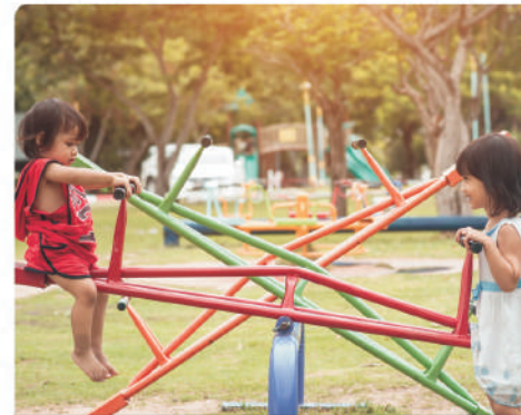
Kids Playing Area