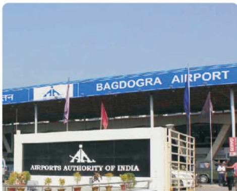
Bagdogra Airport - 43km