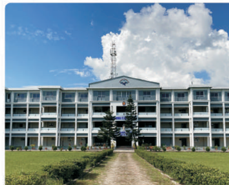
North Bengal St Xavier's College - 23km