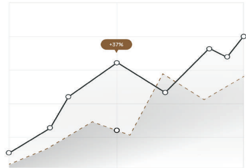
Graph indicating 37% property price growth over the last 3 years.