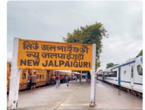
New Jalpaiguri Railway Station - 26km