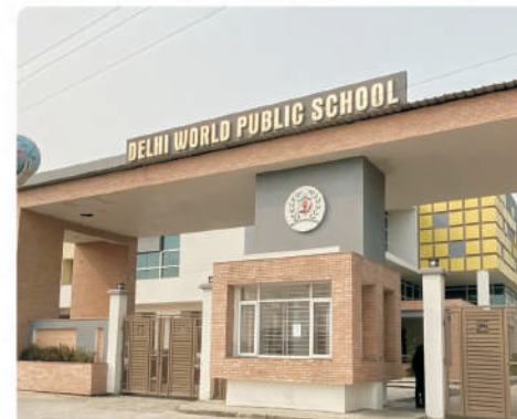
Delhi World Public School - 13km