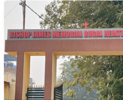
Bishop James Hospital - 22km