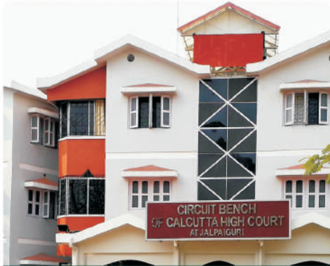
High Court - 18km