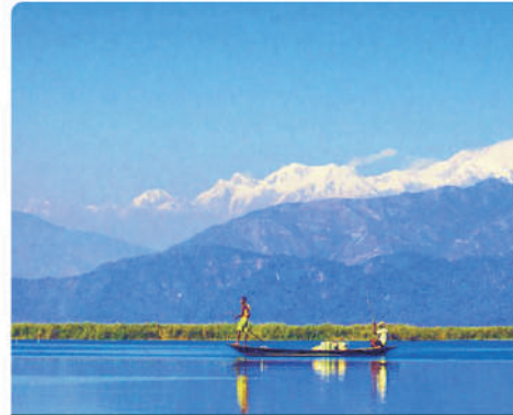
Gajoldoba - 12km