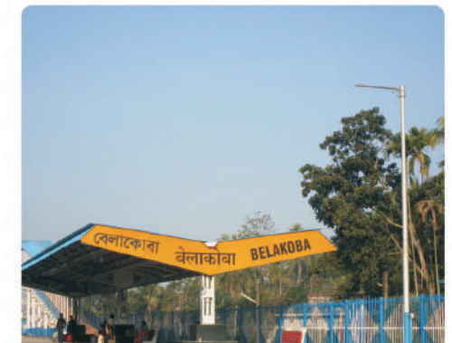
Belakoba Railway Station - 11 Km